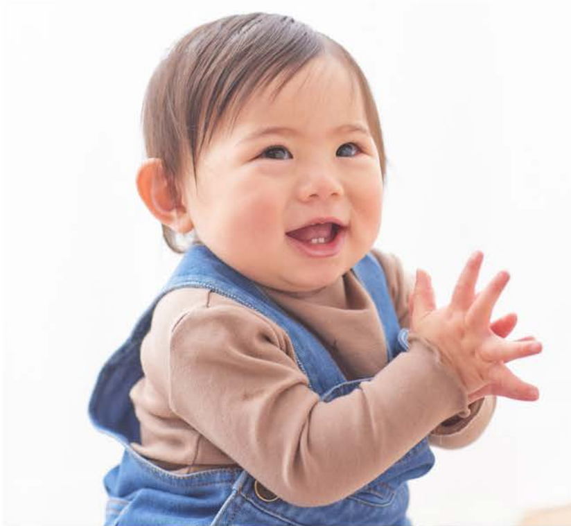
I might clap my hands