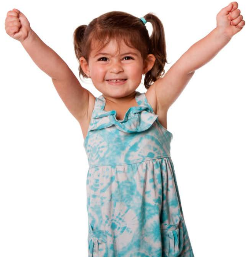
I might cheer!